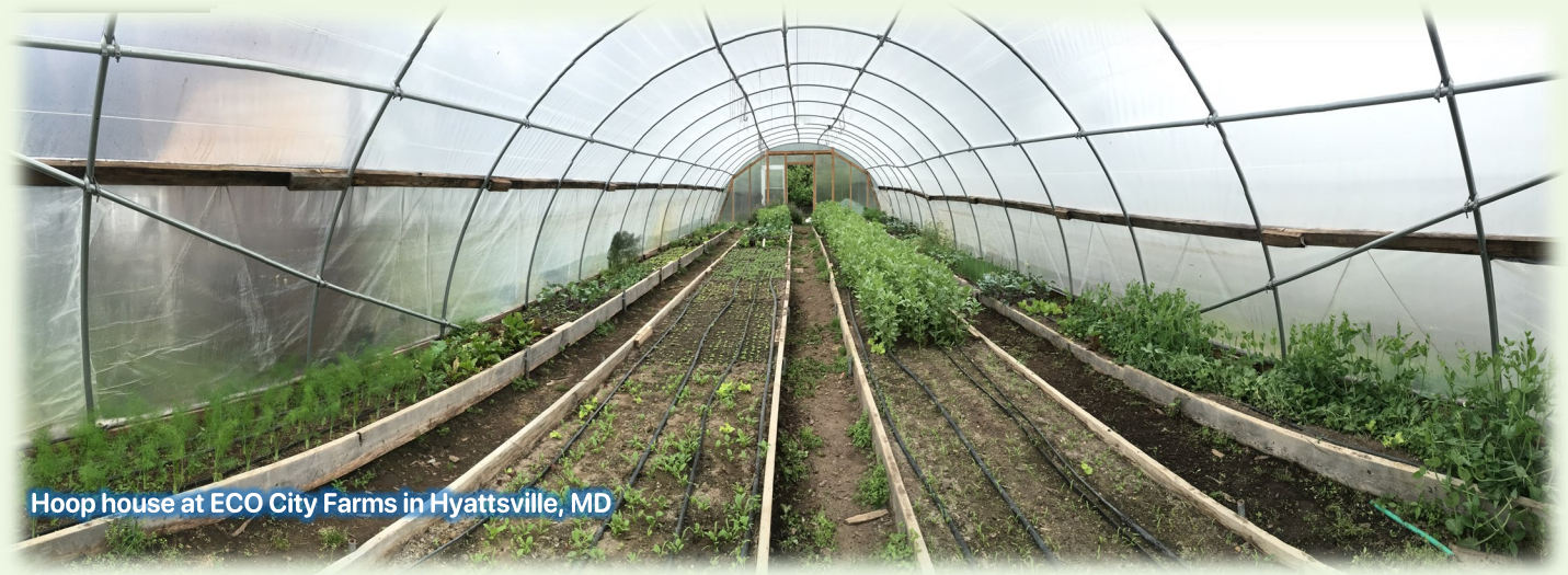
Hoop house at ECO City Farms in Hyattsville, MD