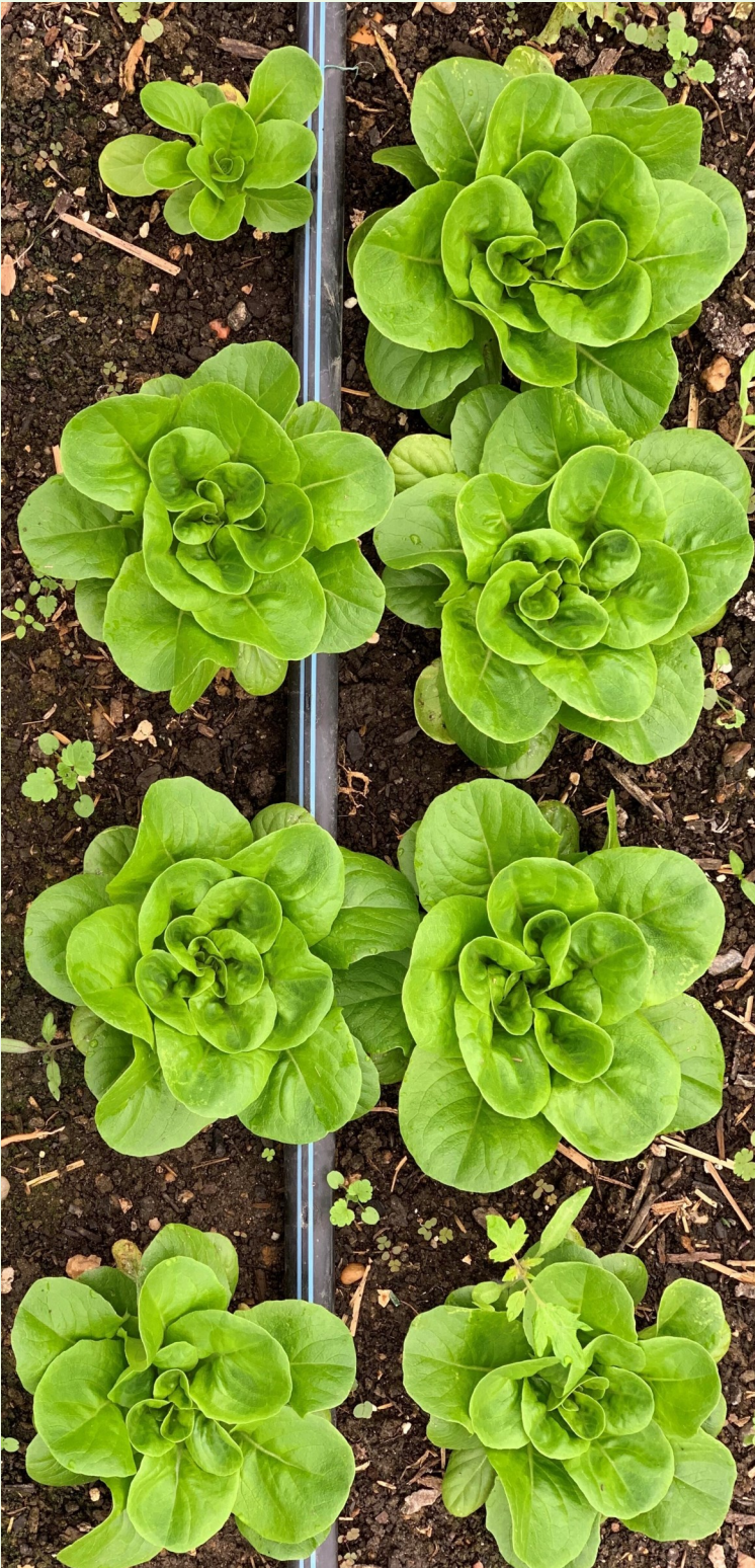
Drip irrigation with lettuce at ECO City Farms in Hyattsville, MD.

Drip irrigation is a delivery system that directs water to the plant's roots. It minimizes water waste, improves plant growth, and prevents excessive moisture to fight fungal diseases.