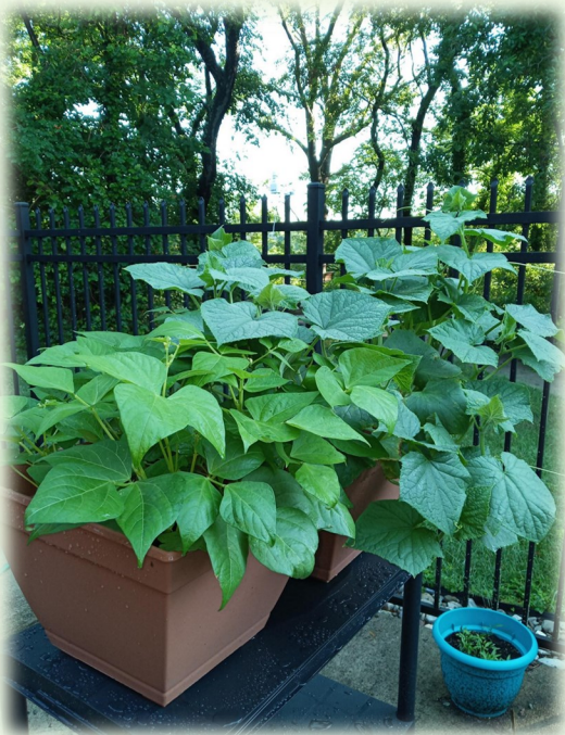
Above: Cucumber plant.

2021 marked the start of the District's Pond View Gardens! Our staff planted tomato, cucumber, green pepper, bush bean, kale, corn, and spinach seeds with bountiful results.