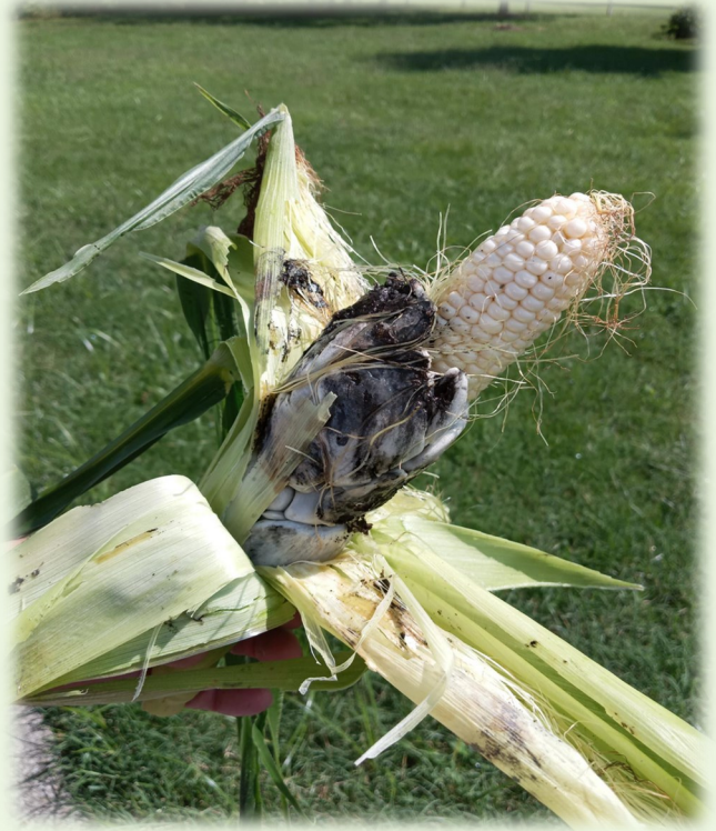
Above: Corn Smut (Truffle)

Have you ever heard of corn smut ? Also known as huitlacoche , this fungus causes metabolic changes in the corn, resulting in galls that grow on and around the kernels. This fungus—which has been consumed since the Aztec times—is a nutritional powerhouse rich in protein, unsaturated fatty acids, lysine (an amino acid), and beta-glucans. Given its culinary history, we couldn't pass on the opportunity to try it as a "mushroom" toast with scrambled eggs, Gruyere cheese, and sourdough bread. Yum!