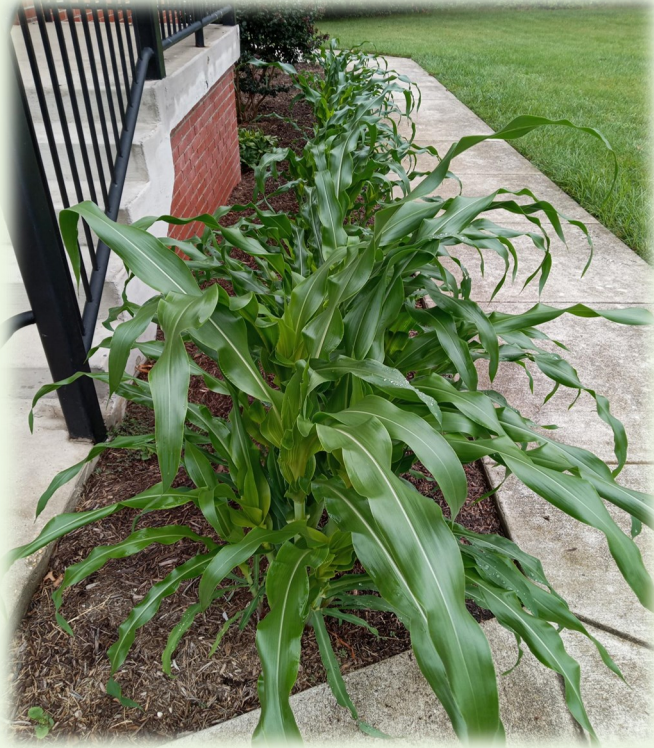
Above: Sweet Corn