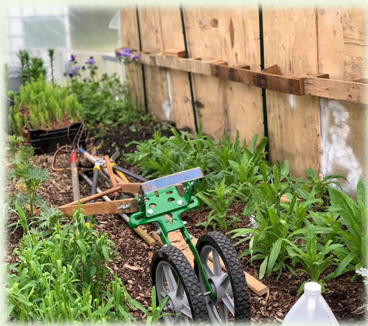
Above: An urban farmer's homemade high-tunnel and wheel hoe.

Our monthly Bloomin' PGC Open Mic Nights blossomed this year as we hosted presenters from USDA, University of Maryland Extension, Future Harvest CASA, ECO City Farms, and many of our County's own dynamic urban farmers. These agricultural service providers and farmers have shared information and resources on topics such as wildlife management, nutrient management, training programs, starting vegetables from seed, crop planning, marketing, and more! Check out our website for additional events and to access our YouTube channel for past program records. There is even a "Find an Urban Farmer" page!