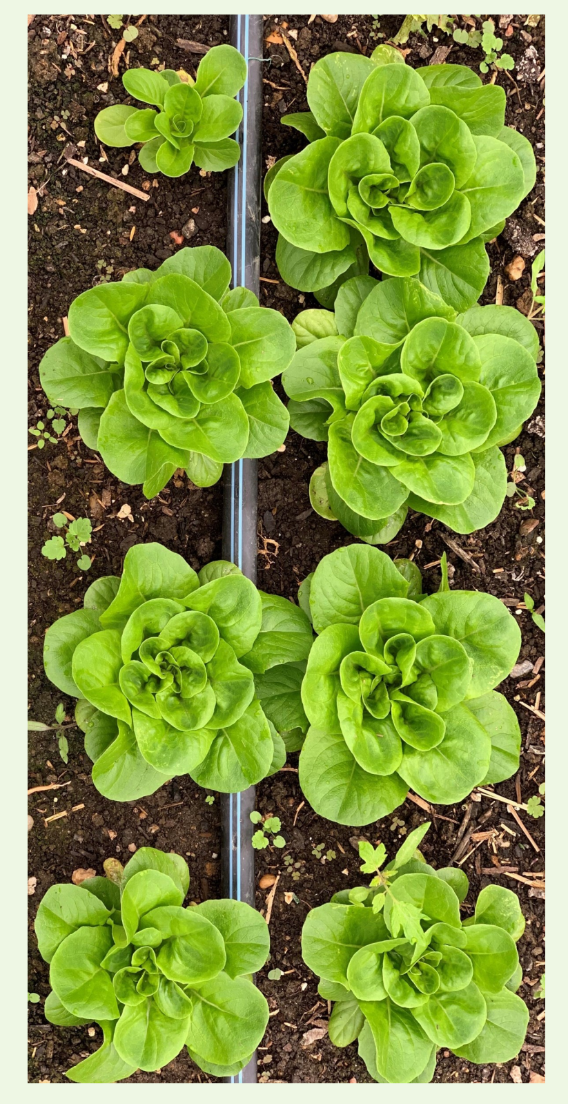
Drip irrigation with lettuce at ECO City Farms in Hyattsville, MD.