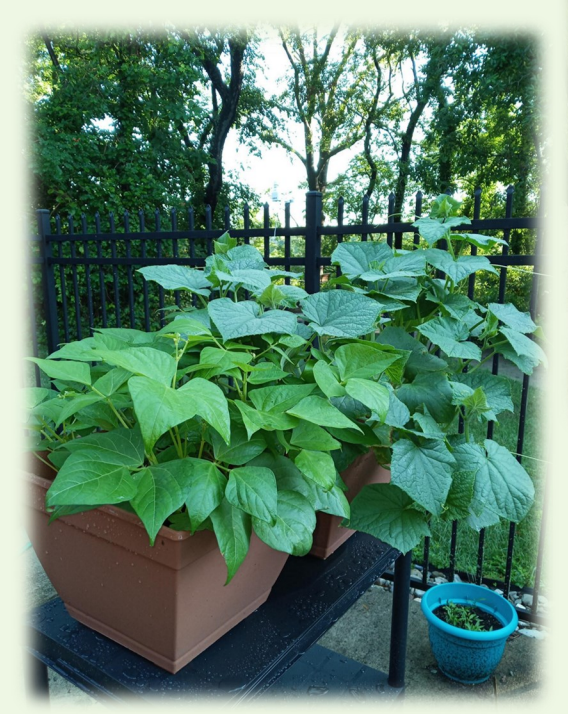
Above: Cucumber plant.

2021 marked the start of the District's Pond View Gardens! Our staff planted tomato, cucumber, green pepper, bush bean, kale, corn, and spinach seeds with bountiful results.