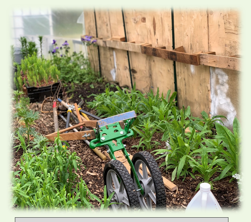
Above: An urban farmer's homemade high-tunnel and wheel hoe.

With our technical assistance, many of our urban farmers are implementing soil conservation practices on their farms such as composting, mulching, cover cropping, nutrient management, and pollinator habitat. Farms range from 1/8th of an acre to almost 5 acres and provide diverse offerings including produce, herbs, cut-flowers, honey, and other value-added products and services. Several farms are now interested in adding eggs to their operations, and thanks to the Food Equity Council, stakeholders, and other urban farm advocates, this may soon become a reality when the new Zoning Ordinance goes into effect on April 1, 2022!